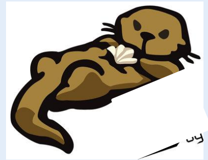
Saturday Camp Fur Sea Otter