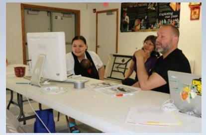
Language App Training

Chugachmiut has student applications available on their web page www.chugachmiut.org we are encouraging students to attend starting July 27 th through August 7 th , more detailed information on this webpage as well.